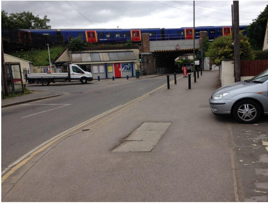
Figure 3: Photograph of the northern side of the rail bridge, looking south