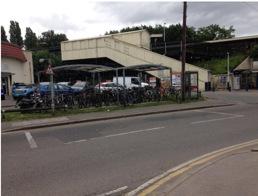
Figure 6: Photograph of the cycle shelters