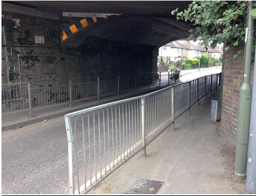
Figure 5: Photograph of the rail bridge, looking south