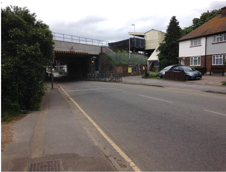
Figure 4: Photograph of the southern side of the rail bridge, looking north